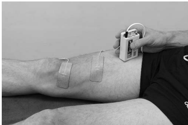
Figure 3. The use of neuromuscular stimulation to produce isometric involuntary muscle contraction.

the quadriceps after knee arthroplasty 140 and ACL reconstruction. 43 However, it is important to note that voluntary muscle strengthening has been found to be just as effective as NMES. 80,111 We therefore suggest that NMES is a useful adjunct to the primary exercise program in ACI rehabilitation and acknowledge that there may be an increased role for NMES in those patients who are poorly motivated, have long-term muscle weakness, and/or are slow responders.