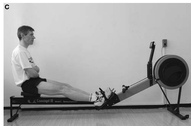
Figure 5. Ergometer rowing without using a handle at (A) the start of drive, (B) mid-drive, and (C) the end of drive.

cycling: active flexion and extension in the ACI limb can be assisted by the non-ACI limb, there is greater proximal stabilization, and loads are applied bilaterally. The relatively slower movement speed of the rowing action facilitates improved neuromuscular control for early-stage rehabilitation, but the higher movement speed of cycling is likely to be more of an advantage in later-stage rehabilitation. Anecdotally, rowing tends to be introduced at a later stage in ACI rehabilitation than is cycling (Table 1), but it is often introduced as a full-range, unrestricted activity. 8,124 With adequate attention to the minimization of joint stress via stroke rate and pace guidance, “no handle” ergometer rowing could be introduced earlier than stationary cycling and could feasibly be utilized as an “active” progression after CPM (Figure 5).