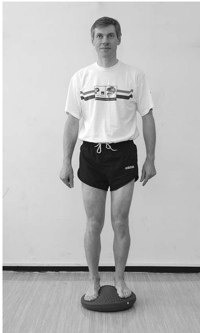
Figure 2. Example of bipodal proprioception exercise using an inflatable disc.