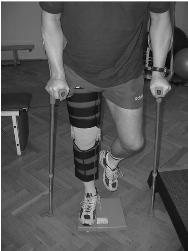
Figure 1. Assessment of the degree of partial weightbearing for a patient on crutches using a set of scales.

the correct amount of weight. A practical way for the patient to monitor weightbearing is to use a set of weighing scales, as shown in Figure 1.